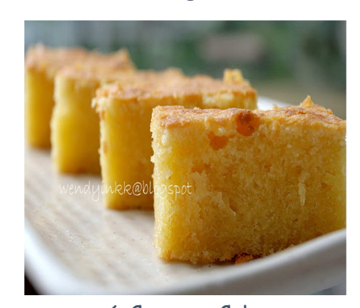
6 Cassava Cake