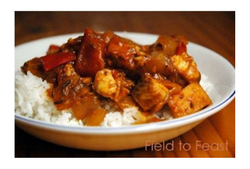
1 Nigerian Fish Stew