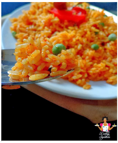
3 Jollof Rice